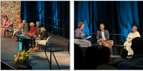
Australian Catholic Education Conference Image Gallery